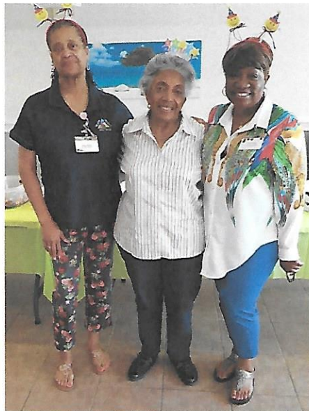
PHOTO OPS.....March Birthdays