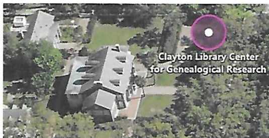
Guest House Cottage is across the parking lot from the Clayton Library